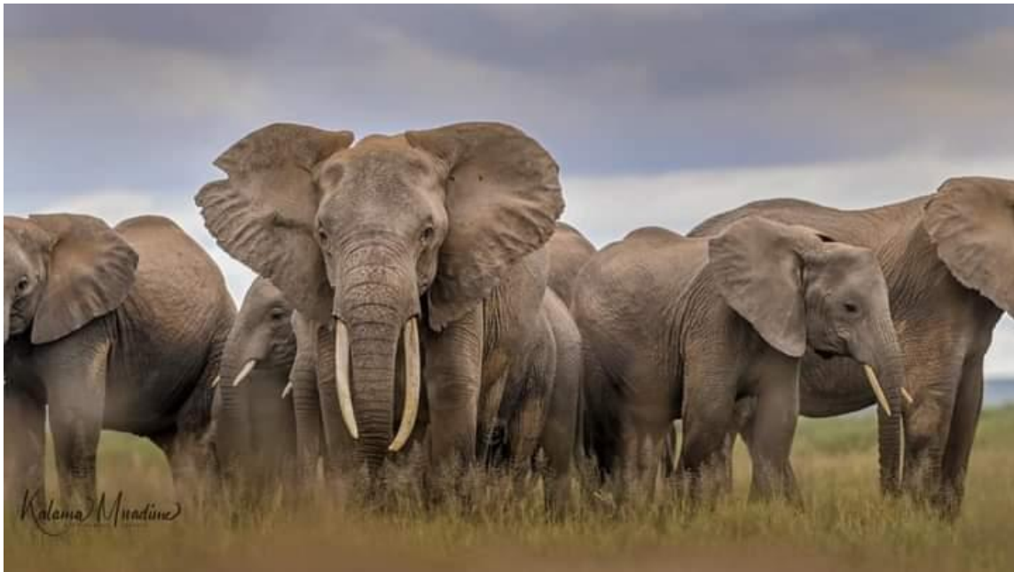
Amboseli National Park