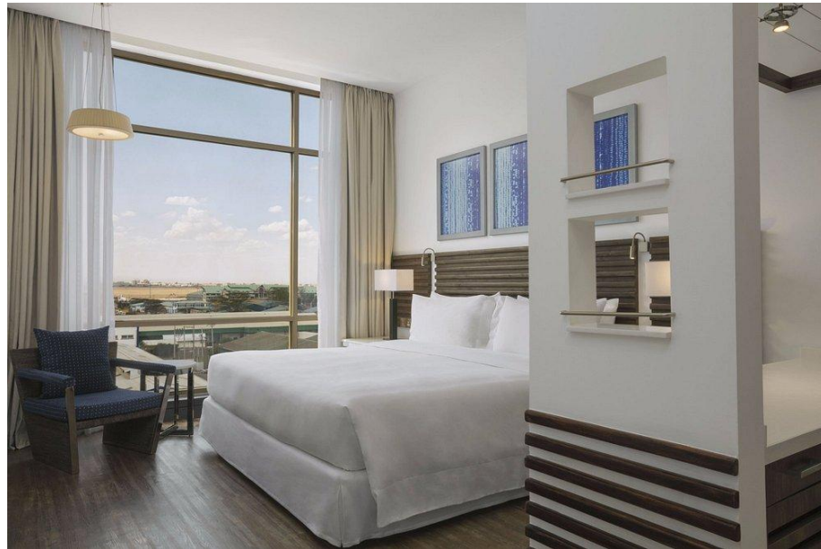
Management Photo Four Points by Sheraton Nairobi Airport