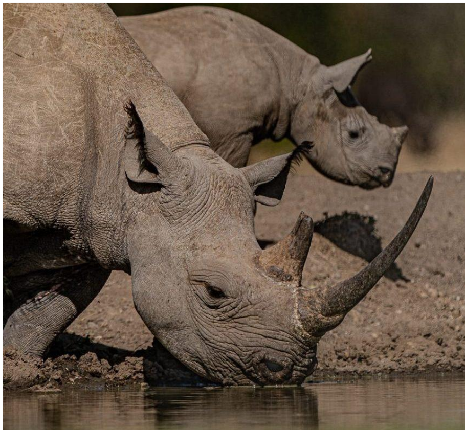
Southern White Rhinos