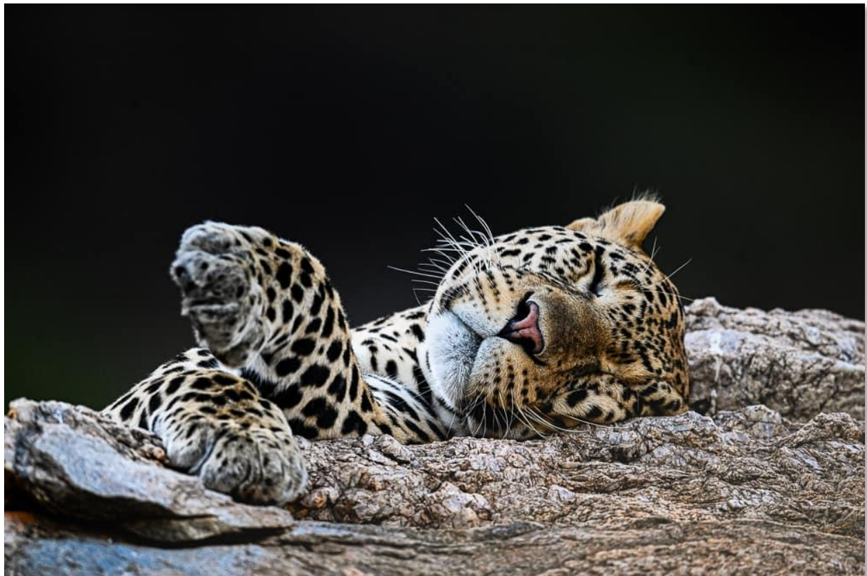
Samburu National Reserve