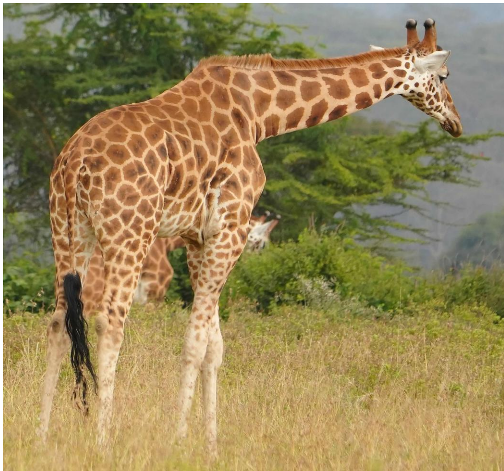
Rothschild's Giraffe Lake Nakuru