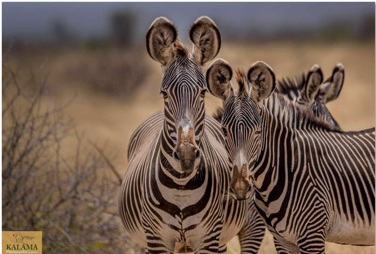
Grevy's Zebras