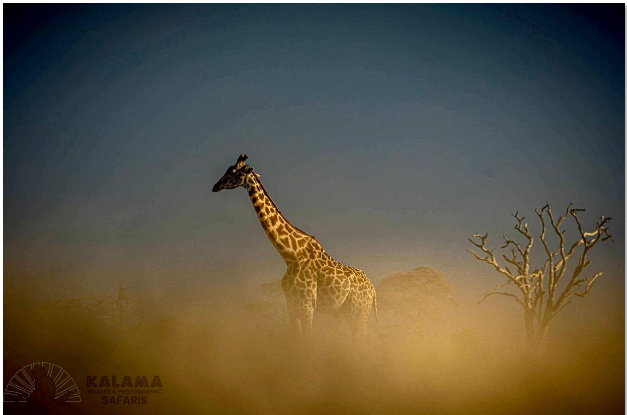
Amboseli National Park