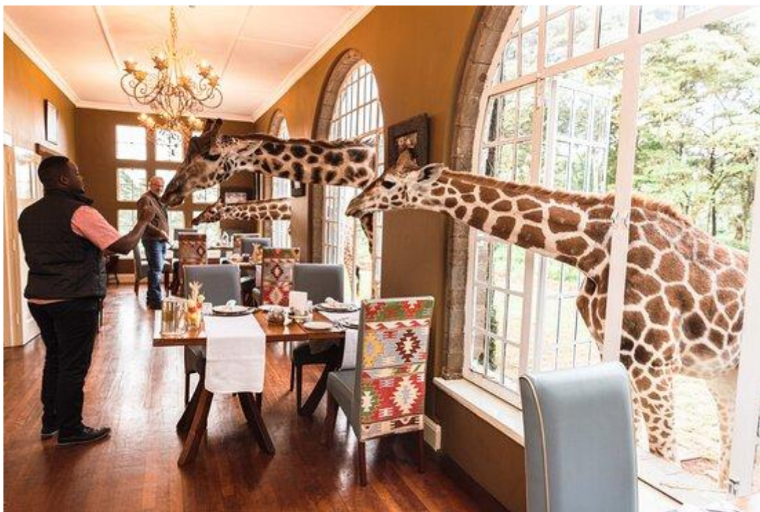
Giraffe Manor - Updated 2025 Lodge Reviews (Nairobi, Kenya)

NOTE: When reservations are made well in advance, you might be lucky enough to get a dayroom at Giraffe Manor where Rothchild's giraffes roam the manor and might even pop their heads through a window.