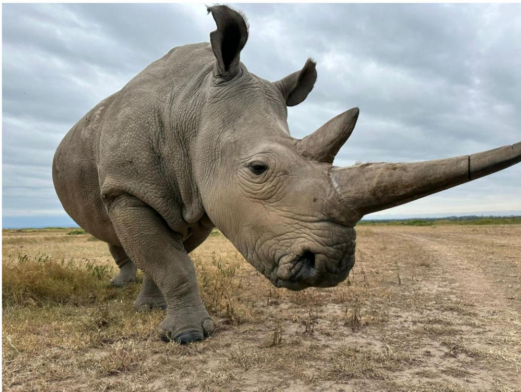
One of the Last Two Northern White Rhinos in the World