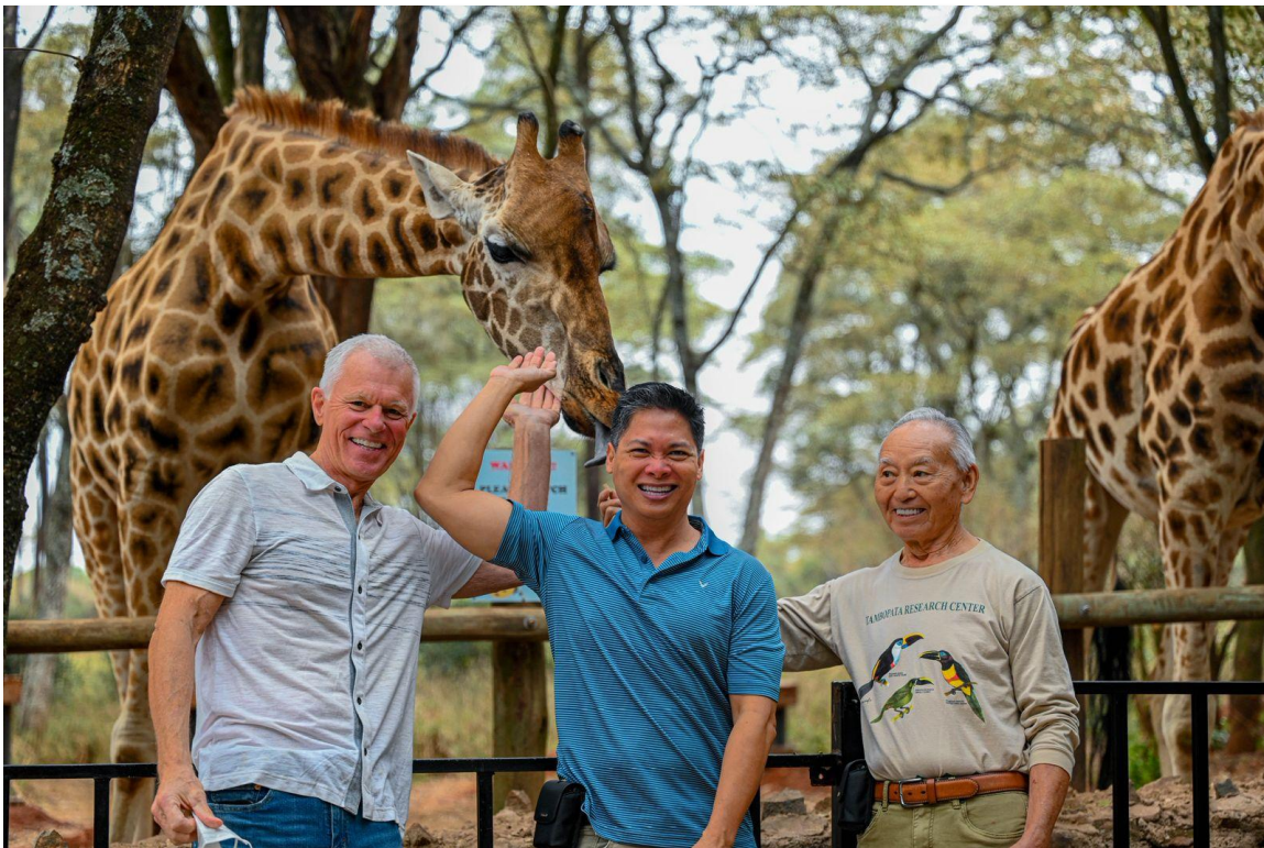
Giraffe Centre