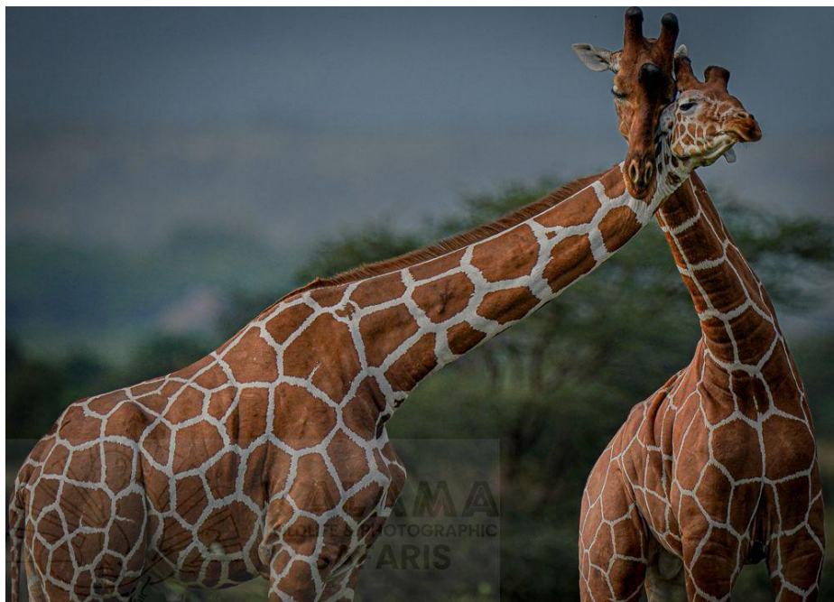
Reticulated Giraffes

This 14-day, 13-night safari adventure spotlights Kenya's graceful giraffes across various subspecies and habitats, while exploring other diverse wildlife in iconic parks and reserves. The itinerary incorporates flights for longer transfers and drives for shorter ones, based on typical safari logistics. Activities feature game drives, wildlife viewing, cultural immersions, and giraffe-focused encounters at each location with stays in comfortable lodges or tented-camps offering full-board meals unless specified. The journey begins and ends in Nairobi, timed for international flight connections on Day 1 arrival and Day 14 departure.