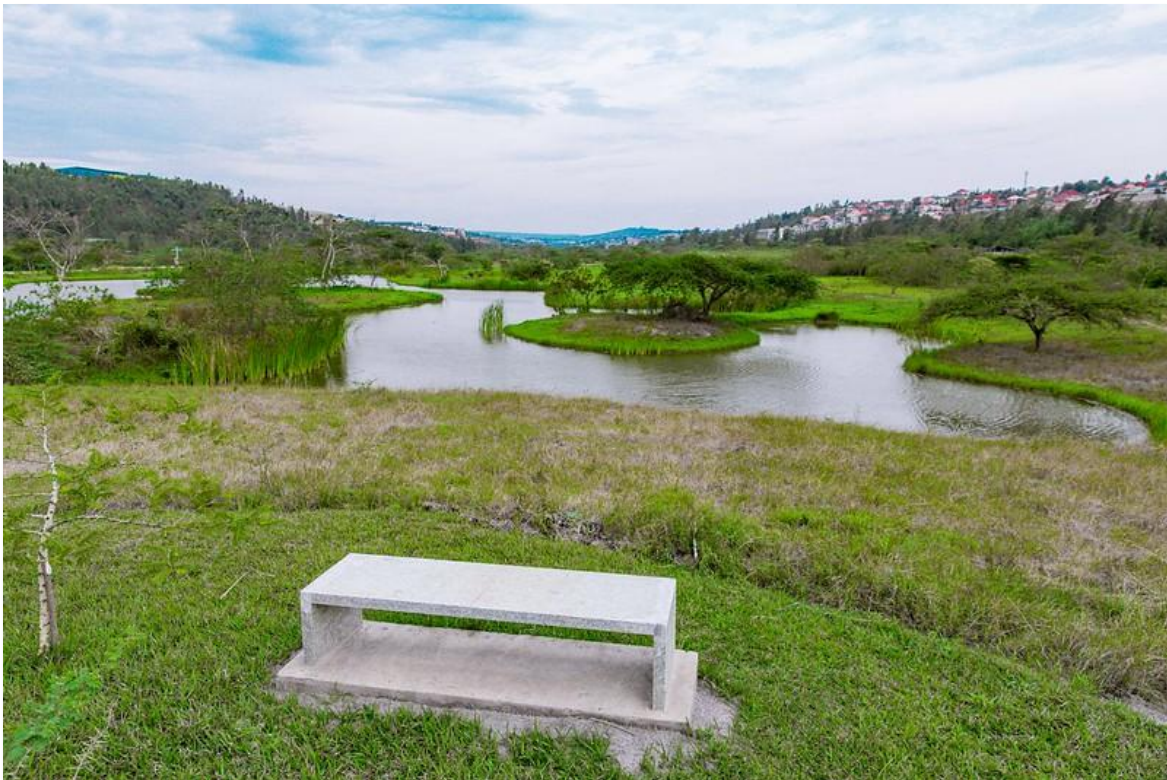
Nyandungu Eco-Park in Kigali