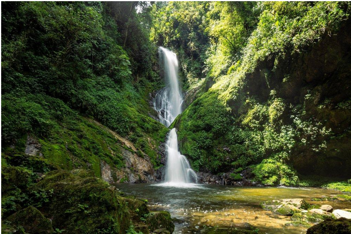
Ndambarare Waterfall in Nyungwe National Park