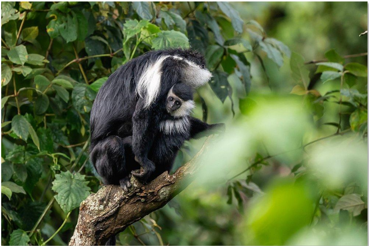
Colobus Monkeys in Nyungwe National Park – Rwanda Management Photo