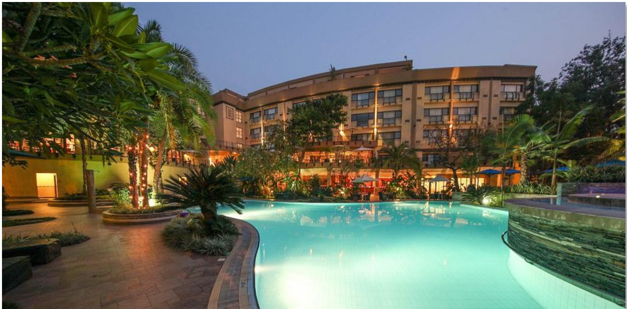
Kigali Serena Hotel in Kigali, Rwanda