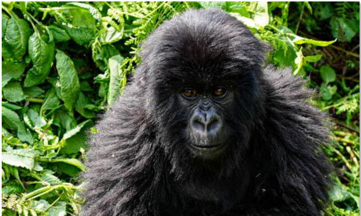
Gorilla Trekking