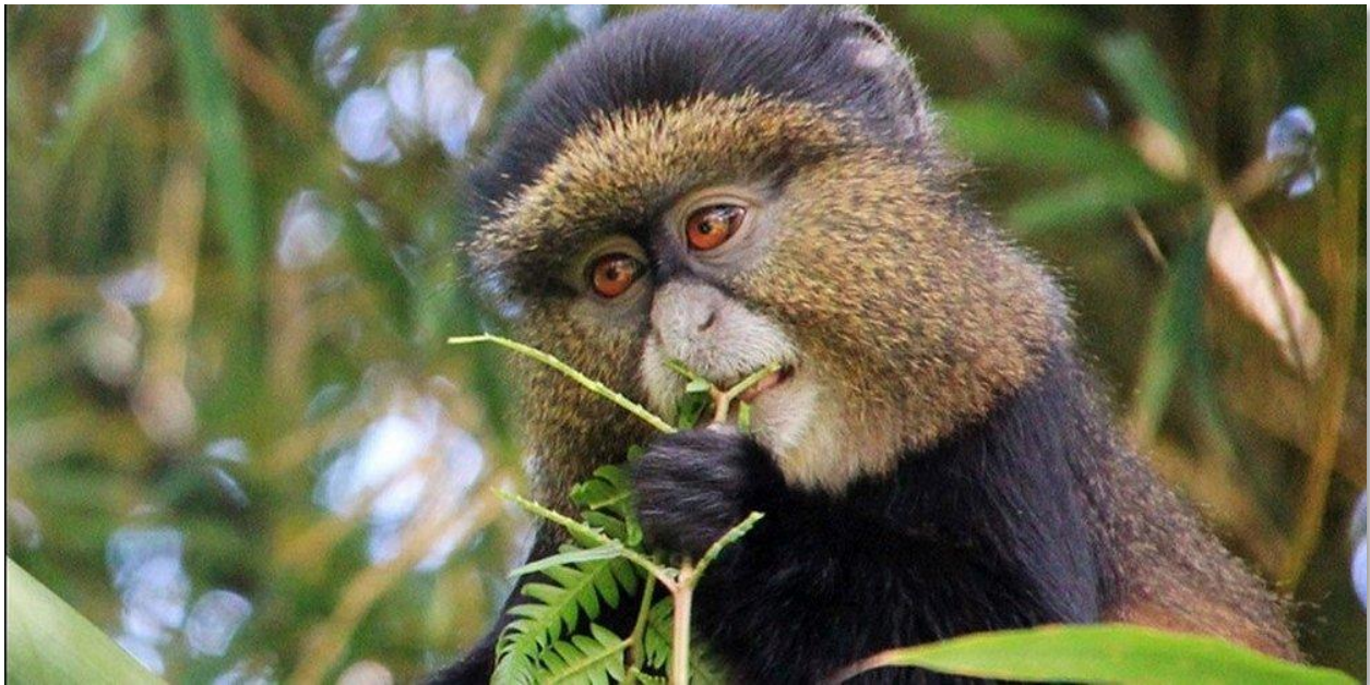
Golden Monkey in Volcanoes National Park Rwanda - Management Photo