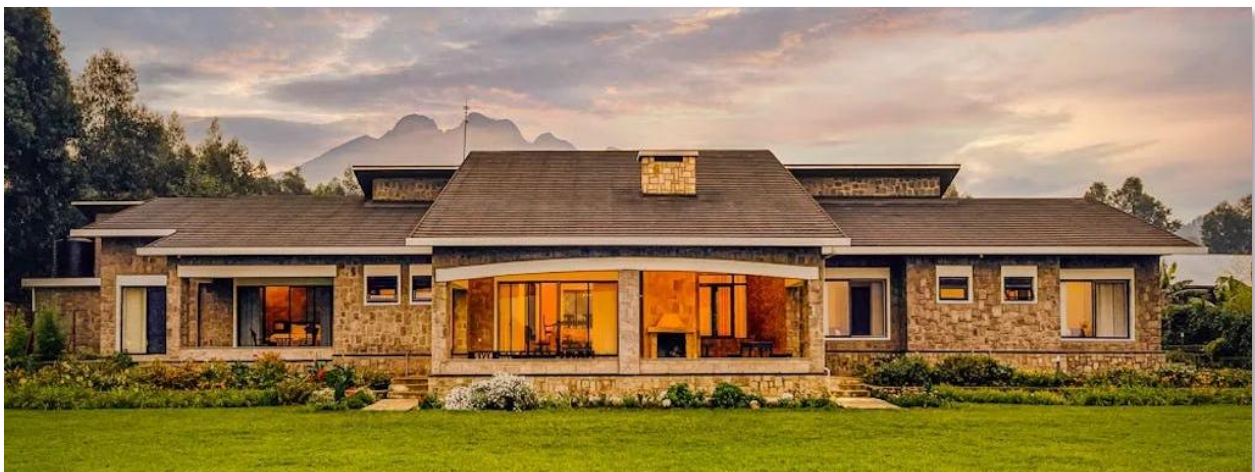
Luxurious Farmhouse Rwanda with Views of Volcanoes National Park - Photo