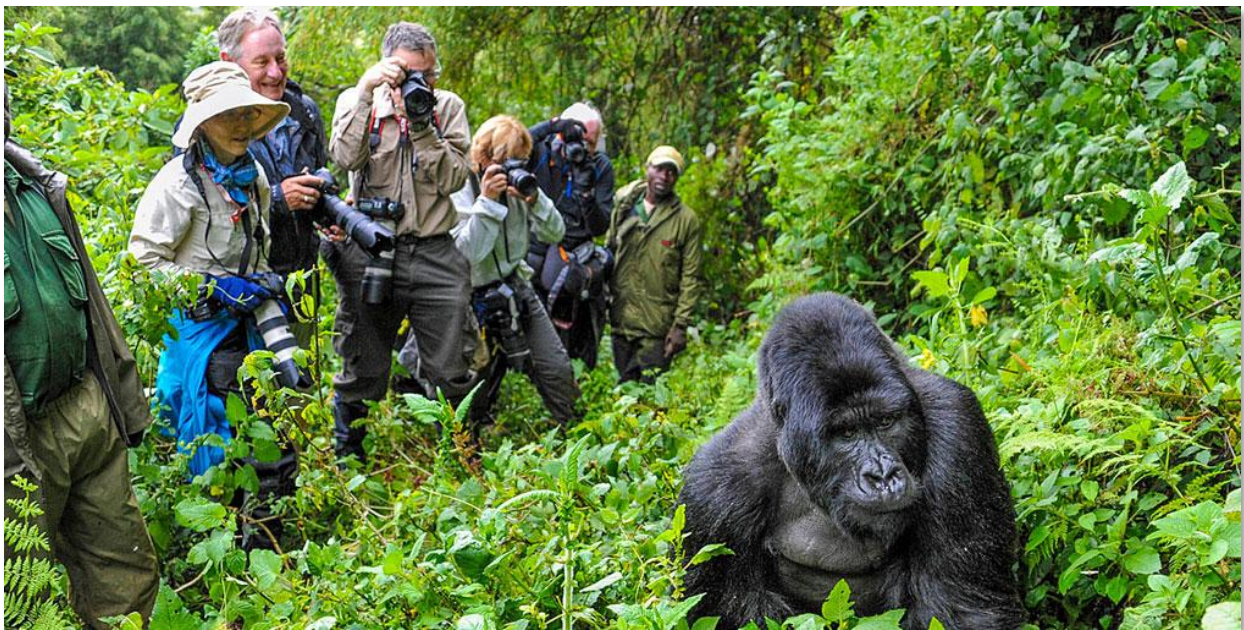
Gorilla trekking in Volcanoes National Park - Photo

This 11-day primate-focused safari ( July to September ) adventure in Rwanda highlights close encounters with mountain gorillas, chimpanzees, colobus monkeys, and golden monkeys, complemented by eco-tours, cultural experiences, and scenic relaxation. The itinerary incorporates flights for international arrivals/departures and drives for internal transfers, exploring diverse landscapes from urban Kigali to lush forests and Lake Kivu. Stays feature comfortable lodges with full-board meals unless noted, emphasizing sustainable tourism. The trip begins in Kigali and ends with an onward flight home or to another destination, aligning with international connections on Day 1 arrival and Day 11 departure.