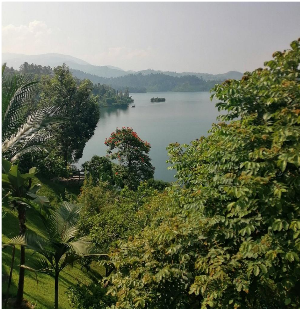
View of Lake Kivu from Inn on the Lake Boutique Hotel