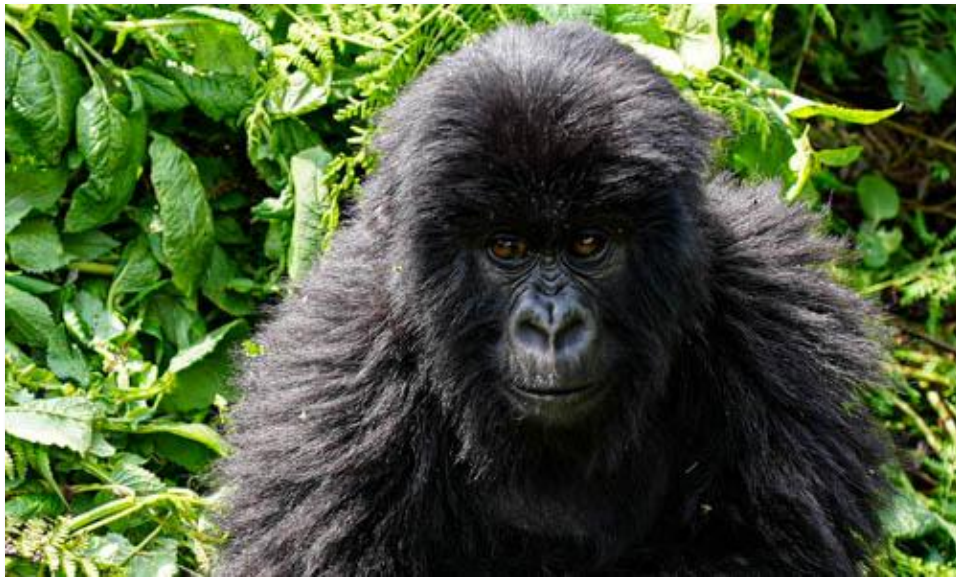
Gorilla Trekking