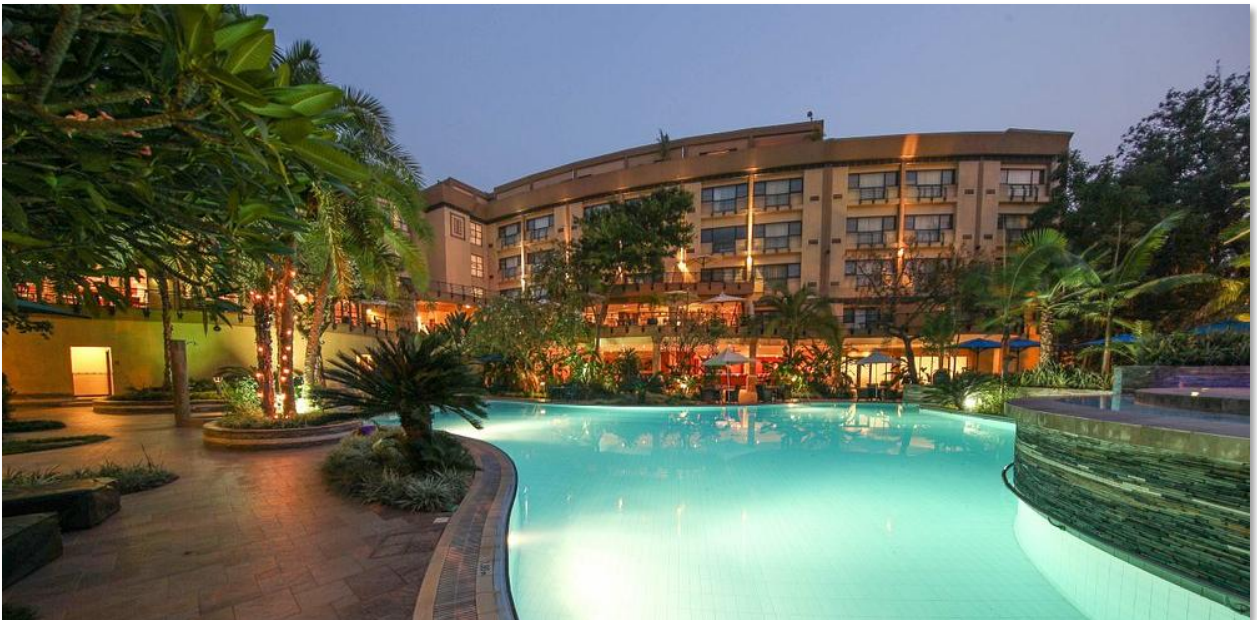
Kigali Serena Hotel in Kigali, Rwanda