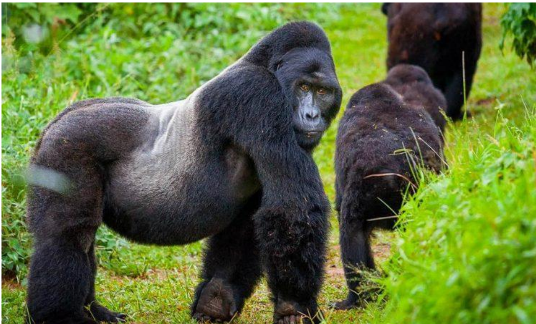
Gorilla trekking in Volcanoes National Park - Photo

POST SAFARI EXTENTION This compact 4-day, 3-night primate safari in Rwanda centers on intimate encounters with endangered mountain gorillas in Volcanoes National Park, complemented by cultural immersion and a Kigali city introduction. Emphasizing sustainable tourism, activities include trekking and village visits, with comfortable accommodation offering full-board meals unless noted. The itinerary starts in Nairobi and ends with a flight to Nairobi, perfect for extensions or international connections on Day 1 arrival and Day 4 departure.