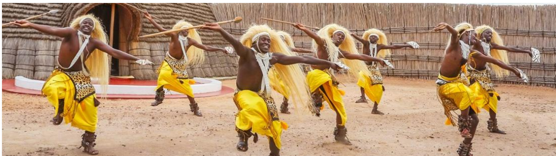
Gorilla Guardians Cultural Village (Iby'Iwacu) - Photo