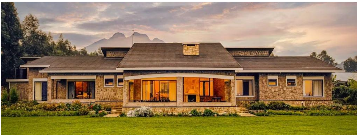
Luxurious Farmhouse Rwanda with Views of Volcanoes National Park - Photo