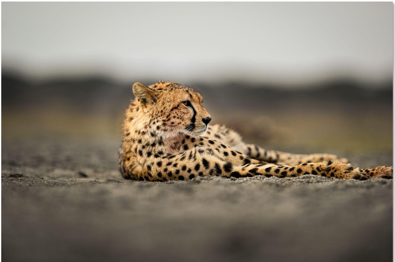
Cheetah Lounging in Ndutu