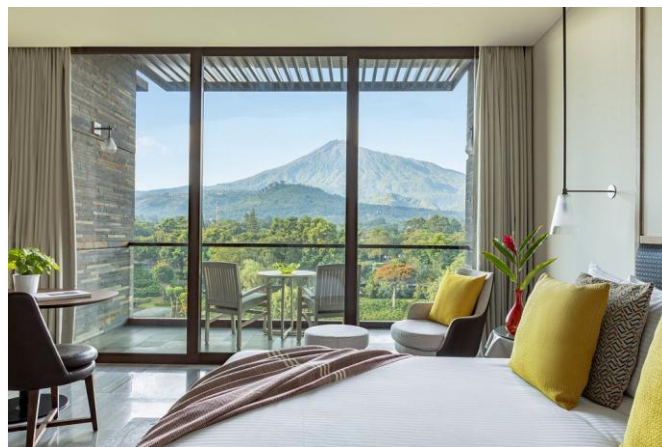
Management Photo – Gran Melia Arusha