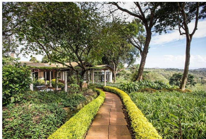
Management Photo - Gibbs Farm, Tanzania